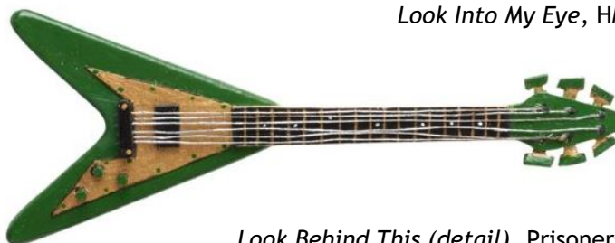
Look Behind This (detail) , Prisoners Abroad, Silver Award for Craft, 2017