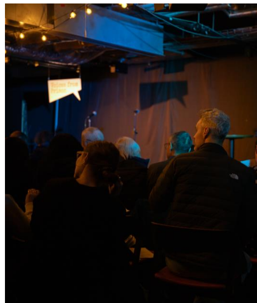
Voices from Prison audience

DST in they come, Snitch run intel spun. Razor rage, Pava sprayed, Wrapped up and segged away.