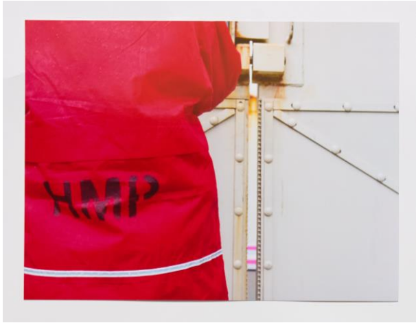
Shared Light (1 of 5) , HM Prison La Moye, Zelda Cheatle Bronze Award for Photography, 2024