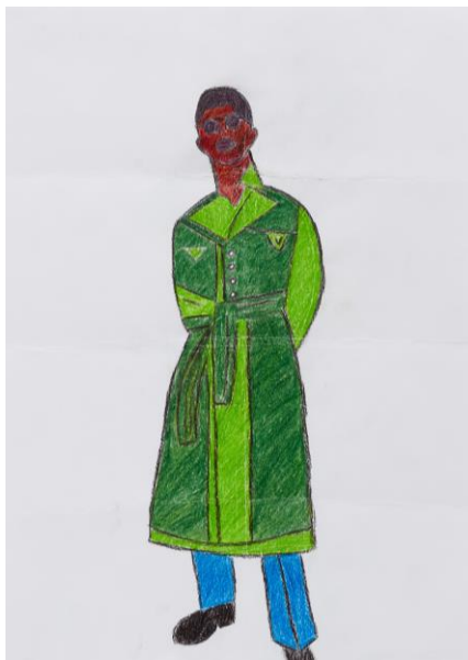
The Matrix , HM Young Offender Institution Feltham, Arts Society Chiswick First-Time Entrant Award for Drawing, 2021

5 a Day , HM Prison Woodhill, Handmade Book, 2024