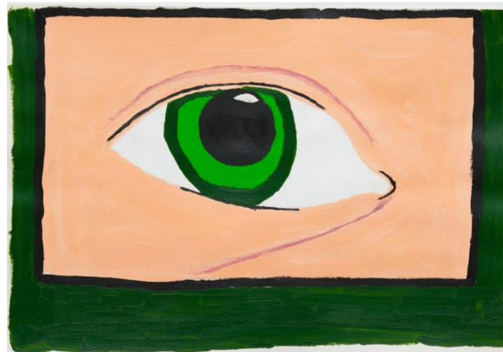
Look Into My Eye , HM Prison Peterborough, Painting, 2023