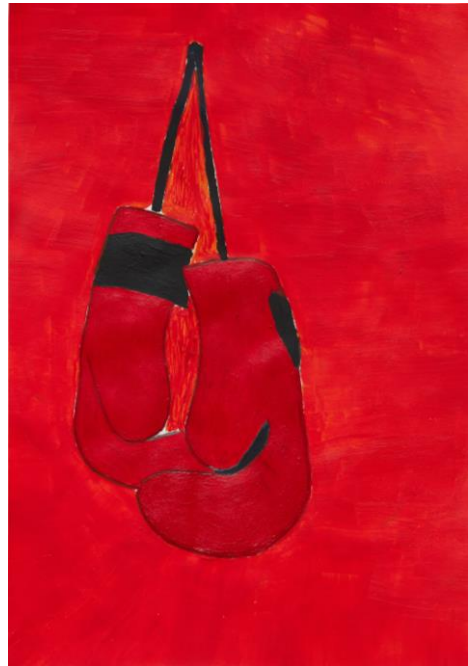
End of the Day , HM Prison Greenock, Commended Award for Painting, 2023