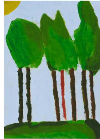
Trees , HM Prison Cookham Wood, Outstanding Debut Award for Painting, 2024