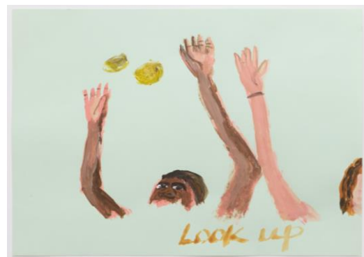
Relax , HM Prison Belmarsh, Silver Award for Painting

Our latest Art Aid sheet is also enclosed. It features a drawing task set by exhibited artist and mentee Luis. If you would like to be sent these creative activity sheets directly each month, write to us to sign up.