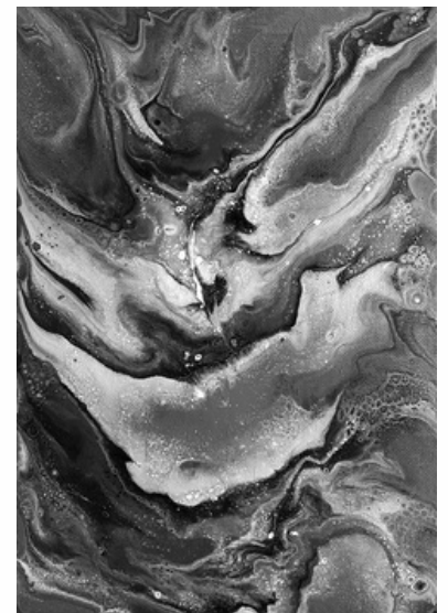
Fish Pond, 2023

To assist in my creative process, I often take reference photographs of places to help remember and reinforce the time and mood. These images are invaluable when it comes to informing and creating new artwork when I am at home. It is one of these photos that forms the basis for this Art Aid sheet.