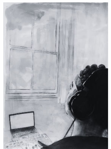
Sanctuary , HM Young Offender Institution Feltham, G&J Charitable Trust Under 25s Special Award for Painting, 2022

This journey has brought me to where I am today, using my experiences and education to help others. I'm committed to supporting those who are incarcerated, helping them find their voice through creativity.