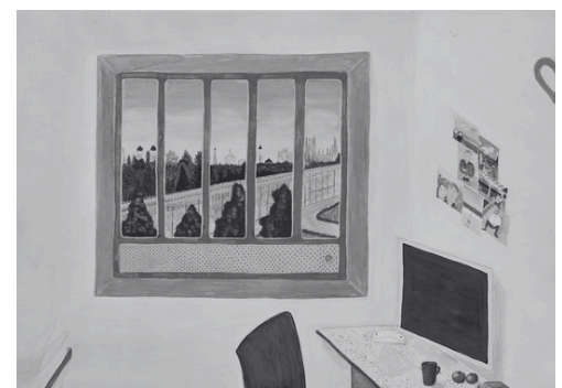
Outlook , HM Prison Peterborough, Commended Award for Painting, 2021

You can repeat this task with the other items on your wall if you have more than one, or try writing the same story from different points of view if, for example, you choose a photo with multiple people in it. Just put pen to paper and remember - you are good enough!