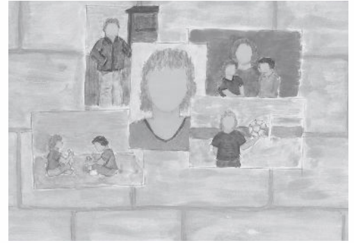
Prison Walls , HM Prison Inverness, Highly Commended Award for Watercolour and Gouache, 2021

Most of you will have photos, cards, letters, notes, or other personal items on your wall or pinboard. I would like you to think about these meaningful things and write a story based on them. Often the best writing is based in what is personal and important to you.