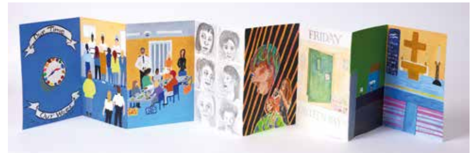
Our Time, Our Week, HMP Send, Gold Award for Graphic Novel

We can try to sell your visual arts and crafts on your behalf. We do this online, in our building and at our exhibitions.