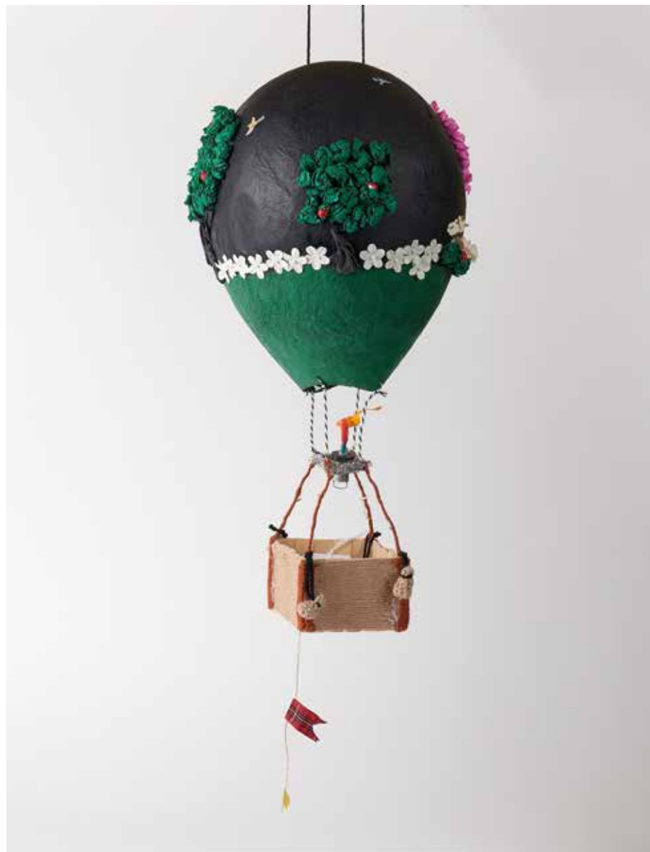
A Day in the Life , The Nelson Trust – Bristol Women's Centre, Commended Award for Themed Category: A Day in the Life