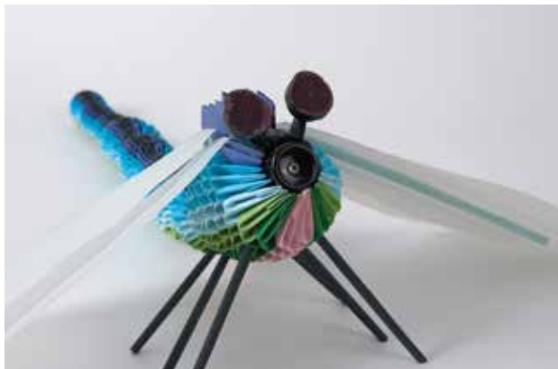
Dragon Fly HMP Elmley Gold Award for Craft

Please do not enter one entry or copies of the same entry into multiple categories. Choose the category that best fits your entry.