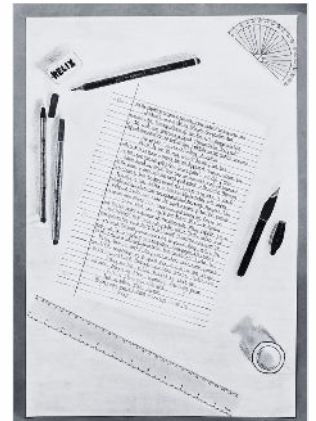
Positivity , HM Prison Wakefield, Avis Allum Bronze Award for Drawing, 2018

Since being released, I've kept in touch with Koestler and they found me a writing mentor. He reads my work, gives me advice and criticism and suggests ideas and techniques. It's so helpful and encouraging that I still have the motivation to write even now I'm working full time. For our next meeting we are going to see a play for inspiration.