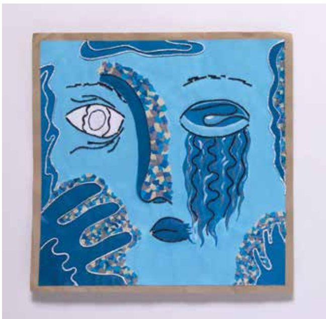
The Blue Period, HMP Peterborough, Under 25s Special Award for Mixed Media