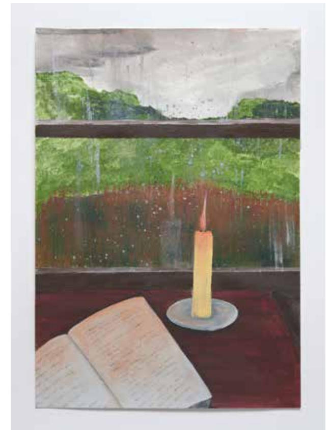
A Day in the Spinney The Spinney Outstanding Debut Award for Themed Category: A Day in the Life

If you use degradable materials, please enter your work in a sealed container so it does not attract vermin or insects. This work may degrade while in our possession.