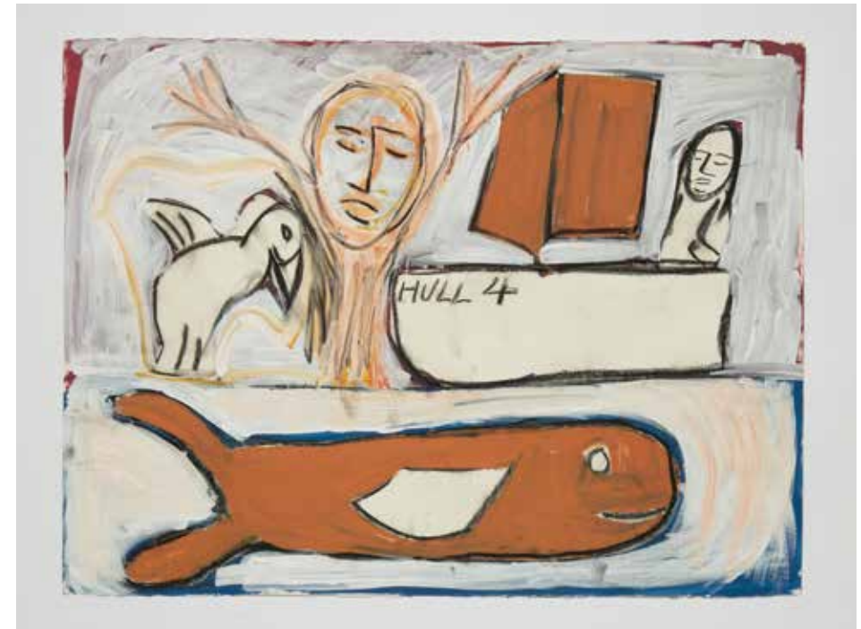
Hull, the Whaling Port, The Humber Centre, Bronze Award for Painting