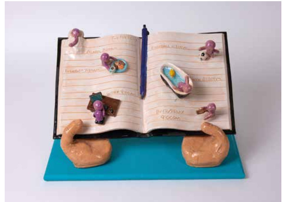
My Day, HMP & YOI Parc, Outstanding Debut Award for Ceramics

I can't emphasise enough how creativity in all its forms boosts mental health and refreshes the brain. It acts as a great distraction, it's something positive to focus on and when the end result is what you envisioned, the sense of achievement is a great boost to your self-esteem.