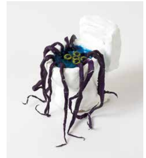
Beast in the Bog HMP Stafford Silver Award for Sculpture

We run an arts mentoring scheme for entrants to the Koestler Awards who want to develop their work further. Eligible entrants will receive further information about this bespoke programme after entering.