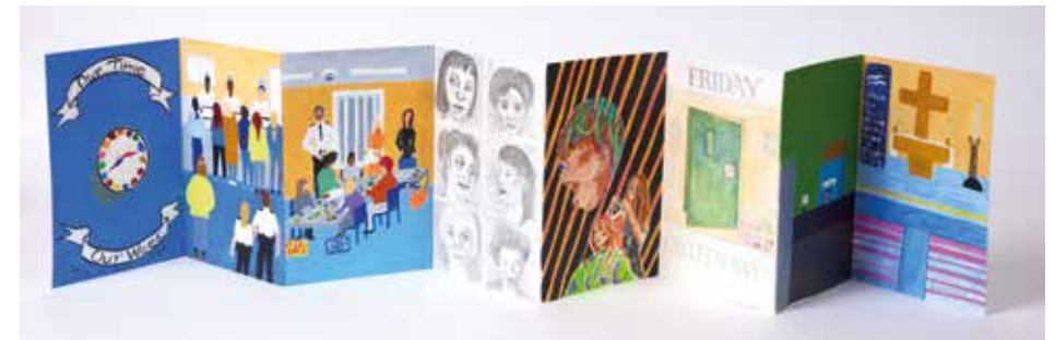
Our Time, Our Week , HMP Send, Gold Award for Graphic Novel

We can try to sell your visual arts and crafts on your behalf. We do this online, in our building and at our exhibitions.