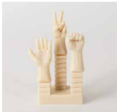
Stop. Unity, Peace HMP Exeter Bronze Award for Sculpture