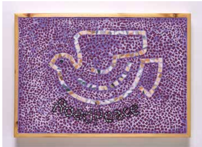
Road Peace Charity 1, Birmingham Youth Offending Service – South, Gold Award for Craft