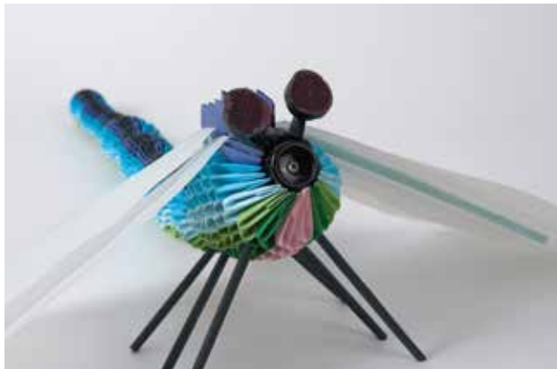
Dragon Fly HMP Elmley Gold Award for Craft

Please do not enter one entry or copies of the same entry into multiple categories. Choose the category that best fits your entry.