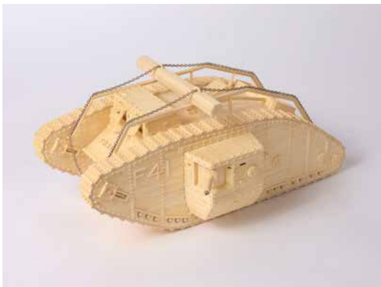
The Siege of Fray Bentos HMP Isle of Wight (Albany) Platinum Award for Matchstick Model