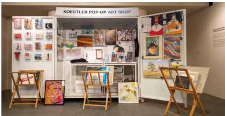
Koestler Pop-Up Art Shop at the Southbank Centre

We will not sell lower than the price you indicate, but we may try to sell your work for more! But, if you are keen to sell, bear in mind that most online and Pop-Up Shop buyers are looking to spend less than £100.