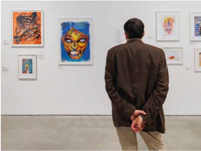
Standing on the Edge, Regional exhibition at the John Hansard Gallery, Southampton.

Having an outlet for my feelings and ambitions, it feels like I'm being of some use, not only for myself but also hopefully for other people too.