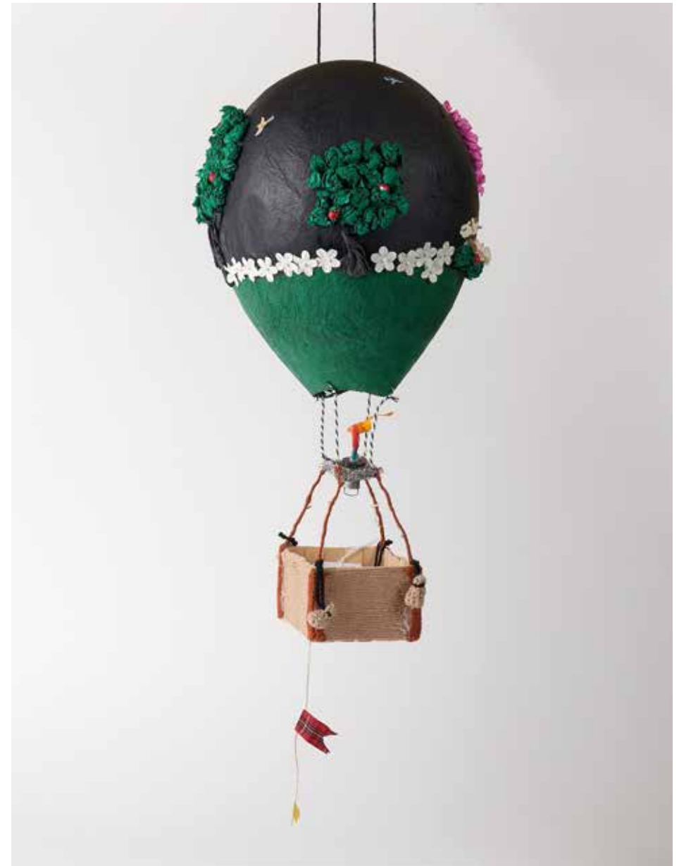
A Day in the Life , The Nelson Trust – Bristol Women's Centre, Commended Award for Themed Category: A Day in the Life