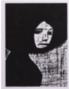
Woman, HMP and YOI Cookham Wood, Under 25s Special Award for Portrait