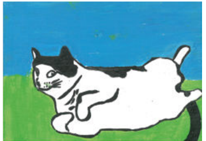
Belle the Cat , Atkinson Secure Children's Home, Outstanding Debut Award for Painting