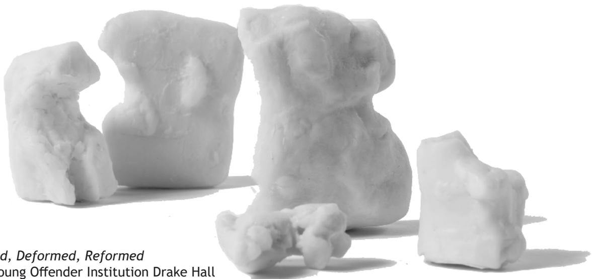
Image: Formed, Deformed, Reformed HM Prison & Young Offender Institution Drake Hall Under 25s Special Award for Sculpture, 2019

Prison showed me how free art is, how there really are no rules or limitations or boundaries with art. Whilst making and creating you are never really locked away. I'm a big believer in there being a strong link between perspective and experience. The way you see the world is the way you experience it - the way you see your art is the way you experience it. If you believe you can create something and are positive and open about trying something new then you will experience the process of making it and showing others your art, in an enjoyable and positive way.