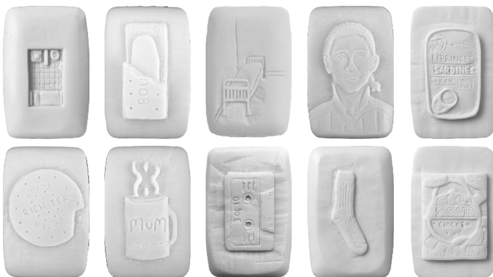
All images courtesy of Lee

If you can get hold of another bar of soap, make another carving! I often work in series - it helps me to better tell stories. I once made a collection of sixteen soap carvings, each one being an item from a canteen sheet.