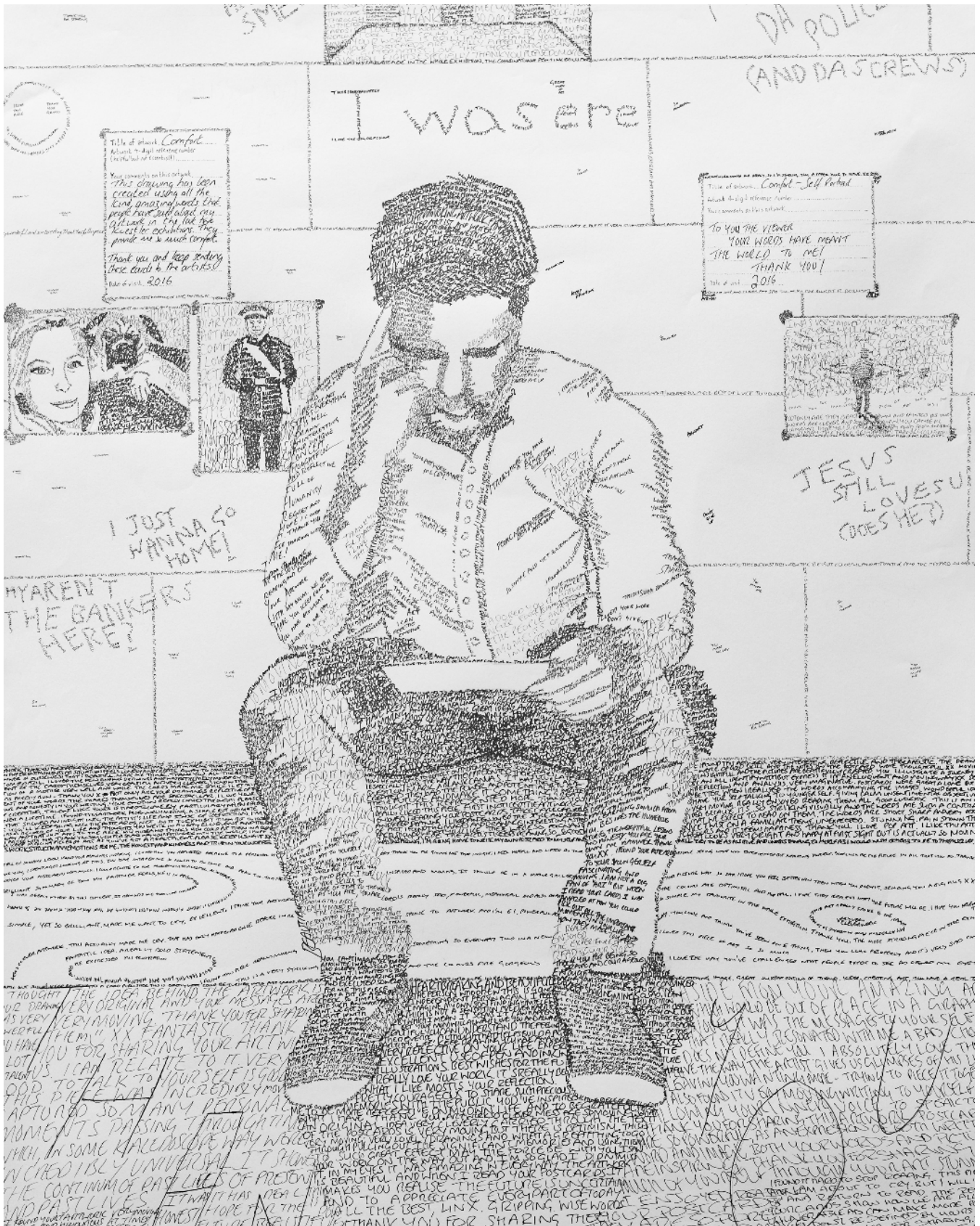
Comfort: A Self Portrait (Or A Picture Paints A Thousand Kind Words) Koestler Arts Mentoring Scheme Unilink Gold Award for Themed Category: Comfort Doughty Street Chambers Audience Choice Silver Award, 2016