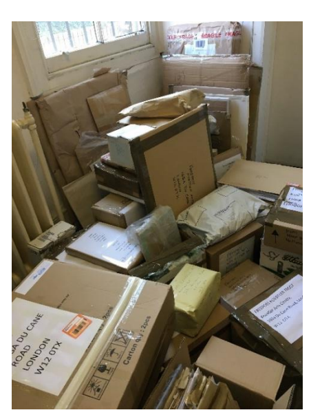
2021 entries arriving at the Koestler Arts Centre

We're delighted to be sharing some exciting Awards and exhibitions updates with you in this newsletter, and hope you'll help us spread the word!