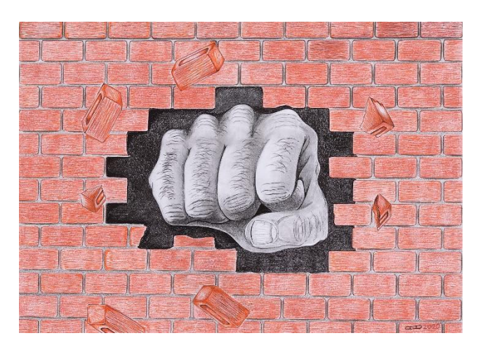
Frustration, HM Prison & Young Offender Institution Forest Bank, First Time Entrant Award for Drawing

The exhibition features many works that tell stories - some fragile, some powerful - each one created by someone finding their voice through the arts. Visitors will travel through open landscapes, forests, a black history dedication, and a pause for self-reflection. They will be able to access a soundtrack of women's voices, and to read song lyrics and poetry from across the region and beyond.