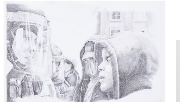
Unmasked, HM Prison Barlinnie, Highly Commended Award for Drawing Audience Choice Gold Award