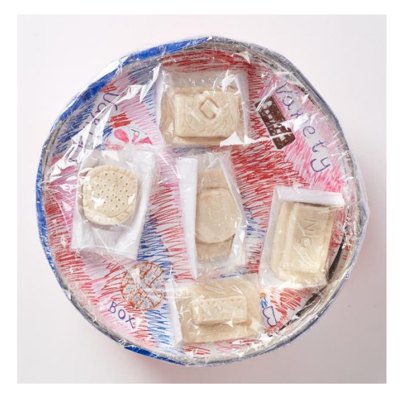
Variety Box, HM Prison Bronzefield, Under 25s Special Award for Sculpture

A reminder that for 2022, our themed category is 'Taste'. We're looking forward to seeing what you are inspired to create!