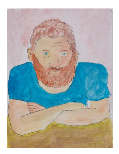
What Next, St Mary's Hospital, Portrait

The latest Art Aid sheet is enclosed with this newsletter. It