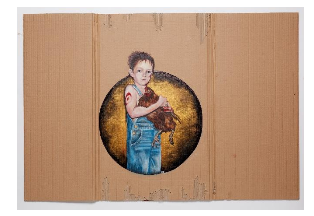
Poultry In Motion, Koestler Arts Mentoring Scheme, Platinum Award for Portrait

Captive, NPS West Sussex, Platinum Award for Watercolour and Gouache This portrait has been painted inside plastic food packaging!