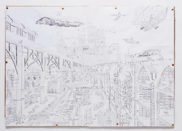
Old Meets New, HM Prison Whatton, Platinum Award for Drawing Audience Choice Platinum Award

"You have absolutely blown my mind and transported me to another reality. After this covid pandemic your work has blown away my dusty cobwebs and reminded me to think big!"