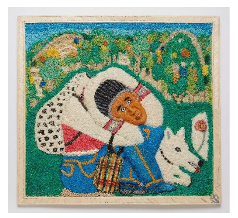
Tears and Sorrow, HM Prison Full Sutton, Platinum Award for Mixed Media

Mexican Art Galleries , HM Prison Frankland, Platinum Award for Poem