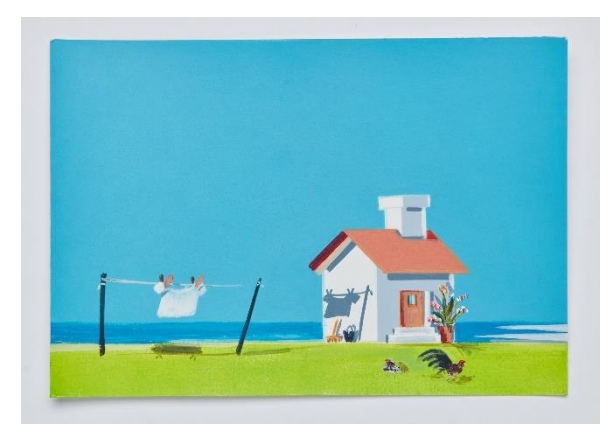
Summertime, HM Prison Shotts, Commended Award for Painting Audience Choice Bronze Award

Visitors to The I and The We completed feedback cards to vote for their favourite exhibited artworks and comment on what they liked about the pieces. More than 5500 feedback cards were completed in total and will be sent directly to the artists. The four pieces that received the most feedback won our Audience Choice Awards and the artists will receive an additional prize: