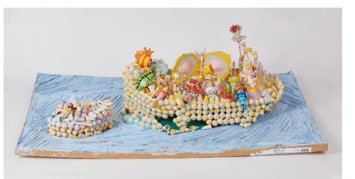
Boat of Freedom, Field House, Platinum Award for Craft