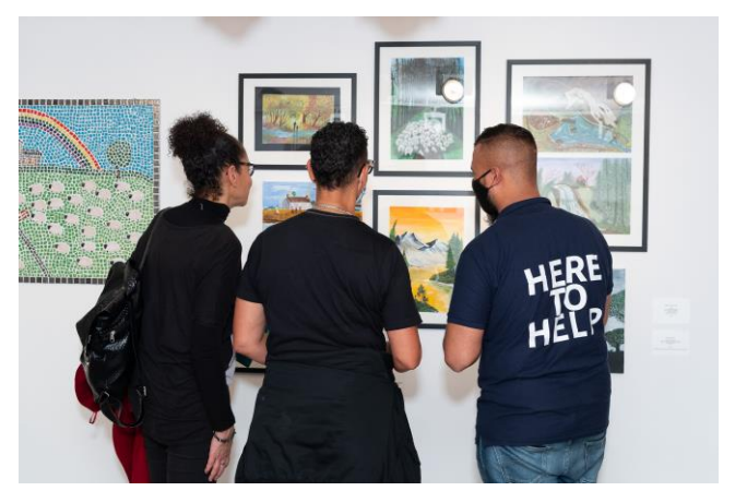
An exhibition host discussing artwork with visitors

It's done a hell of a lot for my confidence and it's allowing me now to do new things, things I definitely never thought I would. I'm going to have to