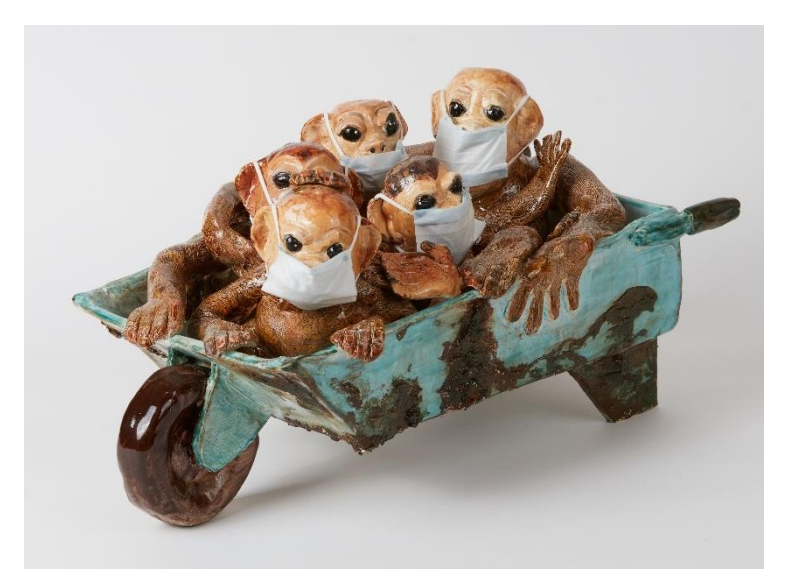
In This Together (Don't Forget About Us), HM Prison Dovegate, May Day Thursday 2021 Platinum Award for Ceramics

We have begun the process of returning unsold visual artwork from the 2021 Awards to entrants. This work will all be sent out by the end of March 2022.