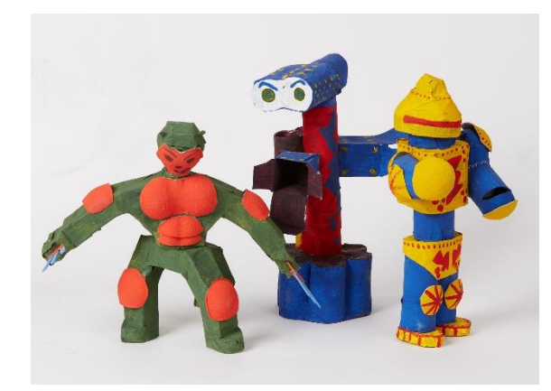
Nuclear Radiation War, HM Prison Winchester, Platinum Award for Sculpture