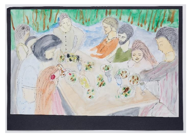
Family Meal, HM Prison & Young Offender Institution Cornton Vale, Themed Category: Together