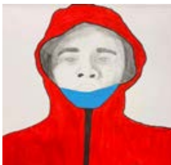
Self Portrait, Vinney Green Secure Unit, Under 18s Highly Commended Award for Portrait