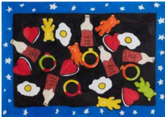
Haribo, HMYOI Wetherby, Under 18s Special Award for Themed Category

✓ Mark the outside of the package you send your work in with the words 'Fast Feedback'.