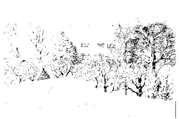
Because Them's The Rules, HM Prison Kirklevington Grange, Gold Award for Drawing 2015