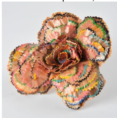
Pencil Sharpening Ring, HM Prison Peterborough, Rethinking Recycling Highly Commended Award 2012