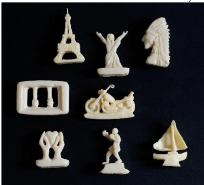
Untitled Soaps, HM Prison Wormwood Scrubs, Inspiration Bronze Award for Sculpture 2015