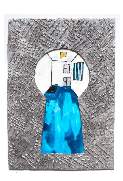
Through the Keyhole, HM Prison Kilmarnock, Mixed Media, 2020