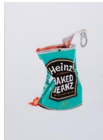
Tin of Beans , HM Prison Oakwood, Painting