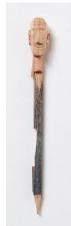
Stick Head , HM Prison Littlehey, Simon Wethered Outstanding Debut Award for Woodcraft