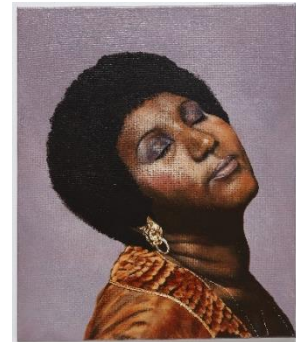
Diva With a Gold Earring , Cupar Social Work Service, Bronze Award for Portrait

“Initially it was quite daunting because we didn’t know where to begin... as time went on and the pieces started speaking for themselves it got easier to pick ones that told a story.” - Co-curator from HMP Shotts