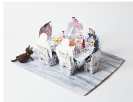
Sunday Dinner at Mum's , HM Prison and Young Offender Institution Cornton Vale, Sculpture