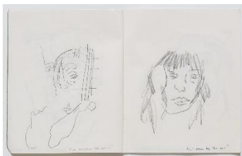
A Collection of Blind Drawings: Finding Essence (Detail), HM Prison Shotts, Bronze Award for Drawing