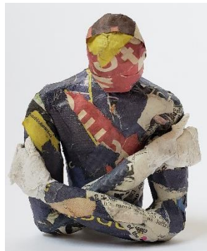
Hug Myself , HM Prison Dartmoor, Bronze Award for Sculpture