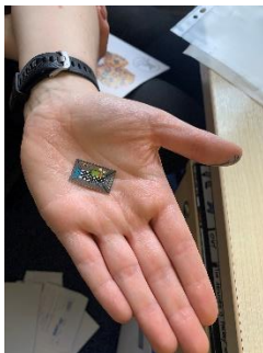
A Little Bit of Personal Space , HM Prison Isle of Wight (Albany), Painting

We hope you're keeping well and look forward to seeing more of your creative work this year! Below are some stand out entries from last year's awards to offer some inspiration.