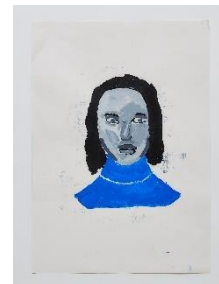
Lady in Blue , HM Prison Peterborough, Painting