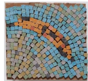
Banana , Victoria Gardens, Themed Category: Taste