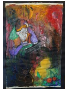
Reading - After Matisse, HM Prison & Young Offender Institution Parc, Painting, 2017

We'll share a selection of our favourite bookmarks in an upcoming Associates newsletter. We can't wait to see what you create, and thanks in advance to those of you who take part! Our supporters will be delighted to receive your bookmarks and your efforts will help us fund this volume of our anthology.