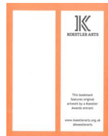
Blank bookmarks enclosed with this newsletter