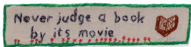
Never Judge a Book by its Movie, HM Prison Ashfield, Craft, 2015