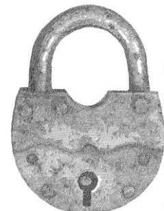
TIME (Padlock), Gary Mansfield

In his TIME drawing series, Gary uses thousands of tally marks - used by prisoners to mark passing days - to create images of locks and barbed wire.