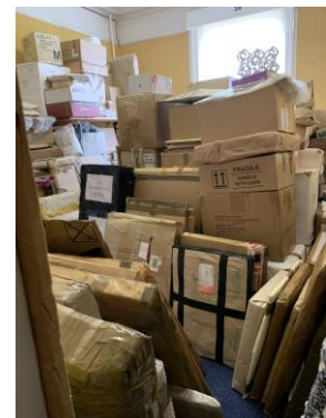
2023 Awards entries arriving at the Koestler Arts Centre

We cannot confirm receipt of entries just yet, but will write to entrants in the summer to let them know their work arrived safely, once it has all been logged on our system. The 2023 Awards results will be announced on our website and sent to establishment staff at the end of August. Good luck to all of you!