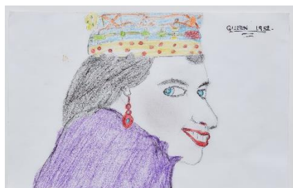
Queen 1952 , HM Prison Lewes, Platinum Award for Portrait