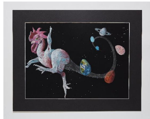
Space Chicken, Devon and Cornwall Police, Space Station Sixty-Five Platinum Award for Pastel