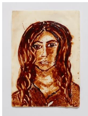
Marmite , Wellesley Hospital, Jeremy Hutchinson QC Platinum Award for Themed Category: Taste

Thanks for sharing your entries with us this year. We published the 2022 Awards results on our website in August and sent certificates out in the Autumn so hopefully you have received these. Below is a selection of Platinum Award winning entries to inspire your future work!