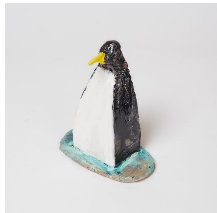
Polestar , HM Prison Dovegate, Highly Commended Award for Ceramics

If you enjoy the task, you can now sign up to be sent new Art Aid sheets directly at the start of every month. Just complete the below slip and return it to us in the Freepost envelope provided.