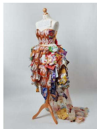
The Wasteful Taste of Consumerism , HM Prison Bronzefield, Clare Askew Platinum Award for Themed Category: Taste