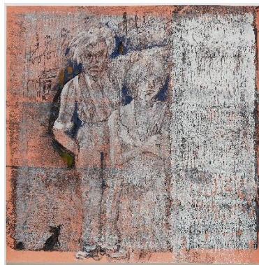
The Road to Wigan Pier (Tribute to George Orwell), HM Prison Channings Wood, Ariane Bankes Platinum Award for Drawing