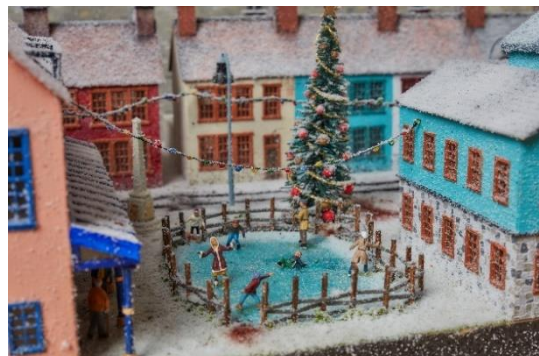
Tynsol Town (detail), HM Prison Isle of Wight (Albany), Commended Award for Sculpture