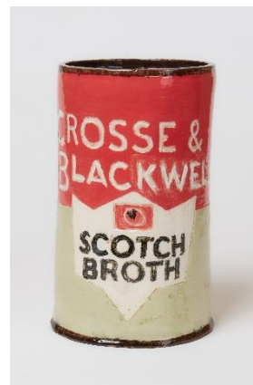
Crosse & Blackwell Scotch Broth , HM Prison & Young Offender Institution Parc, Platinum Award for Ceramics