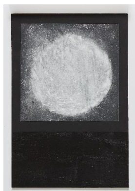
The Ghost of Gaia , HM Prison Frankland, Shearman Bowen Platinum Award for Drawing