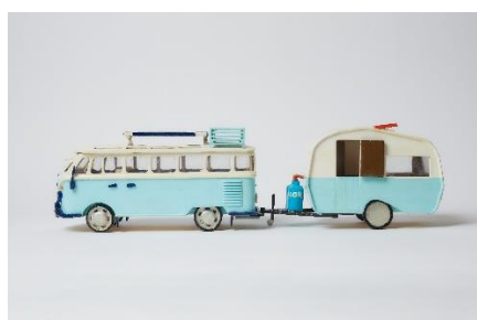
VW Camper and Caravan , HM Prison Edinburgh, Arts Society Greater London Area Platinum Award for Matchstick