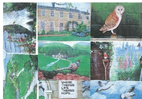
Where There's Life... There's Hope, HM Prison Stafford, Platinum Award for Mural and Wall Hanging