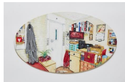
Goodbye to 7 Years on E-Wing , HM Prison Isle of Wight (Albany), Painting

“[From speaking to us, the public] get a little bit of an insight into where the artwork has come from, what the artist has to say about it, but they also get our personal experience and our thoughts on that particular piece of artwork. There’s a few pieces - like Goodbye to 7 Years on E-Wing - people don’t understand that that is literally how all the cells are set up. Without having someone to say “This is exactly how it is, and you’ll have your phone there, and the door there, and the toilet’s just around the corner”, people wouldn’t understand the context because they’ve never been into a prison cell before. Without having that insight from us they wouldn’t know what the piece really means to somebody and they wouldn’t really take in the tiny little details. They don’t know about the day to day system of the prison and how it works and how challenging it can be to put the artwork together, so we give them that information and it makes the art even more valuable to them.