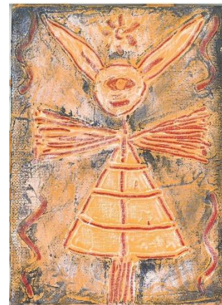
Alienation, Arbury Court, Platinum Award for Painting