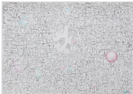
Deus Ex Machina, HM Prison Whatton, Artists' Collecting Society Platinum Award for Drawing