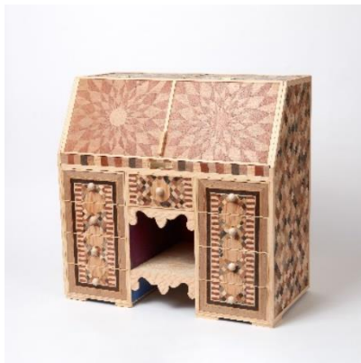
Shades Within, HM Prison Isle of Wight (Parkhurst), Department of Law and Criminology, Royal Holloway University of London Platinum Award for Woodcraft