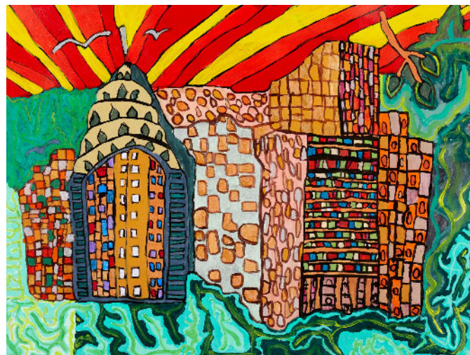
New York Jungle Northgate Hospital Criminal Bar Association Platinum Award for Painting