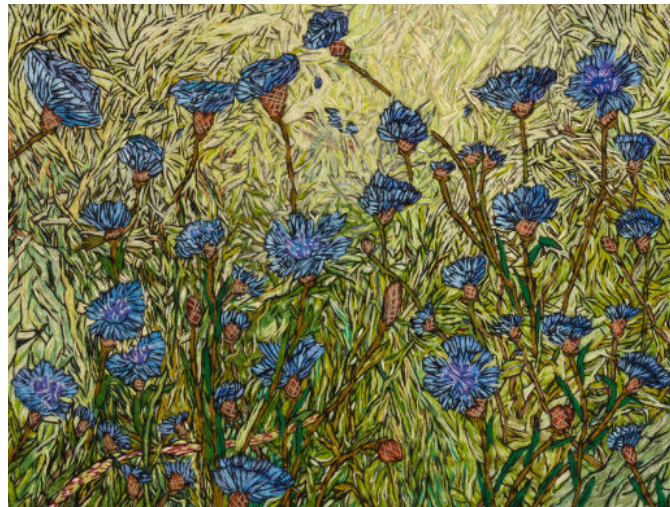
Cornflower Blue HM Prison Leyhill Doughty Street Chambers Visitors' Choice Platinum Award, Needlecraft

Find more information at https://support-us.koestlerarts.org.uk , or please email info@koestlerarts.org.uk or call us on 020 8740 0333 to discuss further.