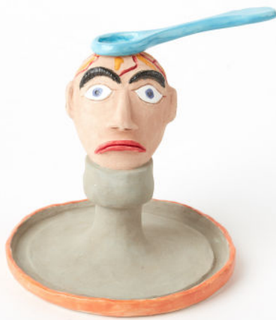
The Con That Cracked HM Prison & Young Offender Institution Parc Gold Award for Ceramics