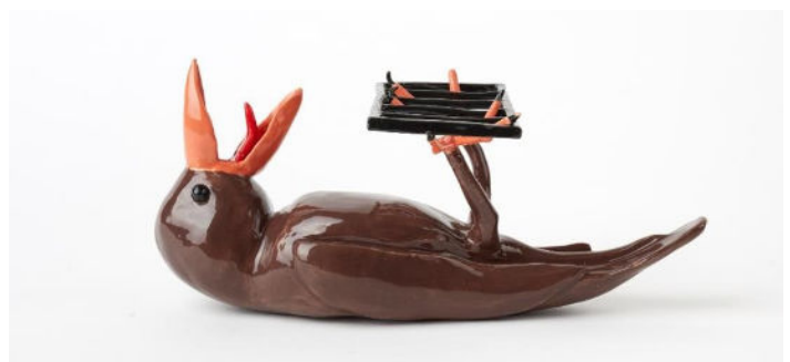
Leggit HM Prison & Young Offender Institution Parc Platinum Award for Ceramics