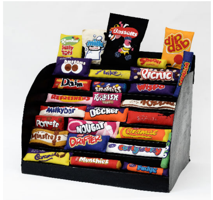
Sweet Sensation HM Prison Send Gold Award for Needlecraft

Donating unclaimed client balances to Koestler Arts can ensure that inactive money is used to help us transform individuals' lives as well as their relationships with their families and the wider community.