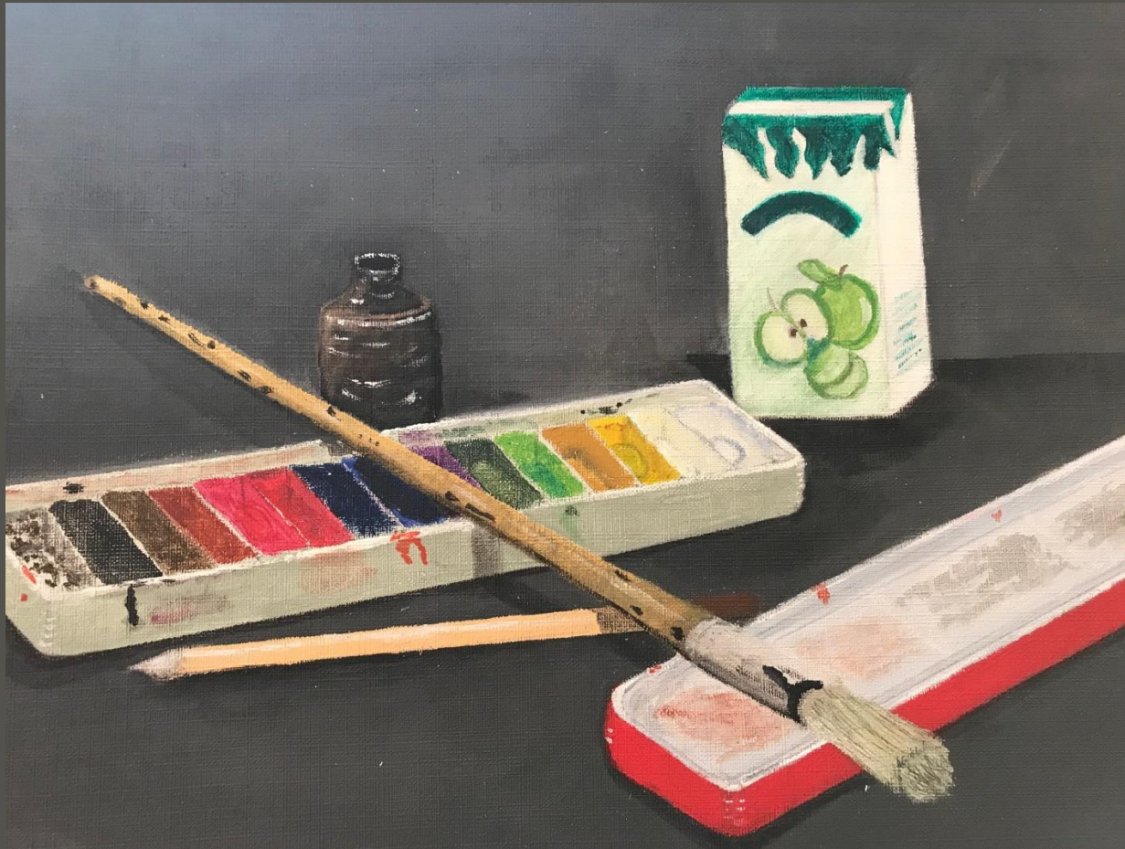
Still Life , HMP & YOI Rochester, First-Time Entrant Award for Painting